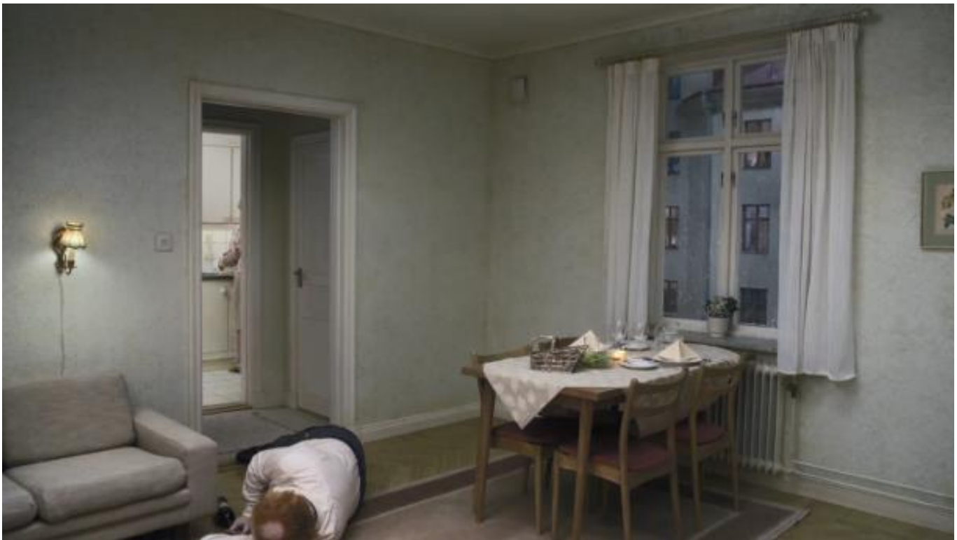
Figure 3 - "A Pigeon Sat on a Branch Reflecting on Existence" (2014)

husband's death in the play, and what cannot be redeemed is the indifferent marriage. Originally love each other, and live together as lovers, but they are full of estrangement. In the second paragraph of "Three Appointments with Death", an old woman dying in a hospital bed clutches a handbag full of jewellery accumulated in her life and refuses to let go. In vain, her children persuade her to let go; she starts to pull the old woman. In the shouting, the abnormal relationship between the two generations is exposed naked on the screen through jewelry, a symbol of money and wealth. The old woman's son said, "You can't take a handbag to heaven." Everyone knows that people can't take their wealth with them after death, but they still can't let go of their worldly desires. Art is a mirror of life, but postmodern aesthetic theory holds that art is not a mirror, and what art creates is not an illusory delusion but reality. "People die for money; birds die for food", money interests blind human eyes, the tragedy of the characters in the drama is our tragedy; it is hidden in all aspects of our lives.