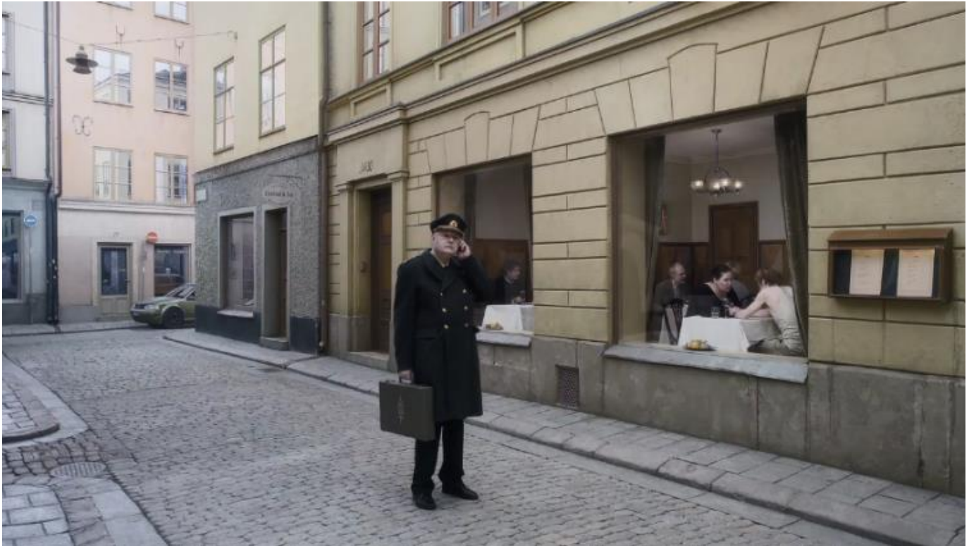
Figure 4 - "A Pigeon Sat on a Branch Reflecting on Existence" (2014)

and the occurrence of many events is flattened in one dimension. From a single point of view, you can see the whole picture, which is an important reason why Roy Anderson's films can have complex philosophical implications.