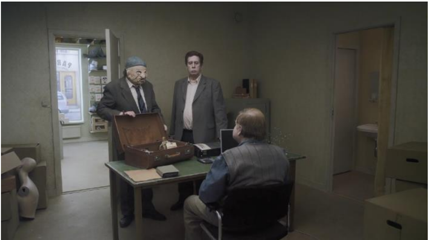
Figure 2 - "A Pigeon Sat on a Branch Reflecting on Existence" (2014)

Danto believes that "interpretation constitutes art"; the existence of art depends on interpretation, but "interpretation" itself implies the prerequisite for the existence of meaning. Postmodern art opposes the exploration of the source, absolute beauty disappears, and the film does not presuppose meaning. Susan Sontag argues that "postmodern cinema itself 'evades interpretation'" [3]. Things that would otherwise be meaningless are cut into the film, and the boundaries of art begin to blur. The two salesmen (Figure 2) in "A Pigeon Sat on a Branch Reflecting on Existence" vowed to bring joy to people, but their products did not make anyone happy and brought a lot of trouble, such as the pressure of product sales, payment recovery, debt collection, funny products as the meaning of joy lost its original connotation, and became only a signifier, whose signified waiting to be reactivated. And it is the audience itself that can activate this reference. The non-utilitarian nature of traditional art makes the audience have to keep a distance and indirectly grasp the connotation of art by viewing it from a distance, while postmodern art shortens the distance and even views it at zero distance, focusing on contact and interaction. The meaning of the premise is cancelled, the right of "interpretation" is delegated to the audience, and the focus of the work is shifted from the author to the audience. Meaning is not presupposed but actively created by the audience.