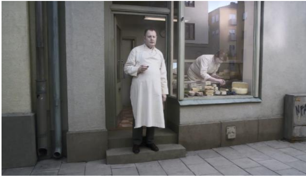
Figure 5 - "A Pigeon Sat on a Branch Reflecting on Existence" (2014)

The effect of this factory duplication is the disappearance of individuality. In the postmodern society, personality is erased, and people are alienated and instrumentalized, no longer looking for the meaning of life but becoming a robot in a factory, repeating the meaningless and boring life. The characters in "A Pigeon Sat on a Branch Reflecting on Existence" are no longer interested in any new things; their eyes are dim, everyone is waiting for something, but no action, looking at everything around them coldly, like a walking corpse, the only thing that can mobilize people's emotions is money, such as the dying old woman who is arguing with her children for jewelry, the salesman who is running around to sell funny toys. He does not care about the fallen stranger but asks how to deal with the food he has bought, and the absurd human nature is infinitely enlarged at this moment, and man no longer has a self but is enslaved by capital and becomes a machine without thinking.