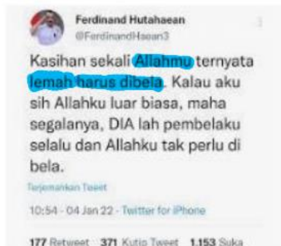
Figure 3. Ferdinand Huttahaean’s Statement as Fake News

This procedure is the next step after data reduction. In this procedure, the researchers displayed what had been done in the data reduction, as stated in the following figure.