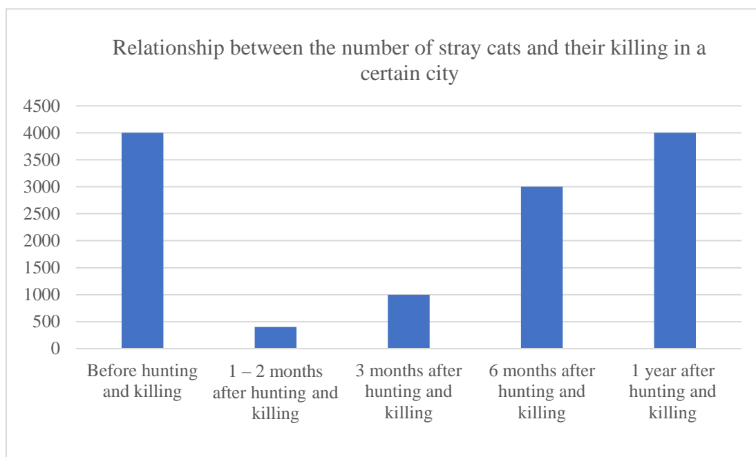
Figure 2. Relationship between the number of stray cats and their killing in a certain city

Of course, the number of stray cats will drop sharply after culling, but it will rise rapidly after a short period of time, causing even more trouble for local residents. According to the International Fund for Animal Welfare (IFAW), in some cases, the mass killing of stray animals has led to the surviving animals moving into new areas, and increased mobility has increased the risk of uncertainty. Moreover, mass killing of stray animals results in the surviving animals getting more food, which enhances their ability to survive and reproduce, so that they can live into adulthood. So within a few years, the number of stray animals in the area will go up to its original level.