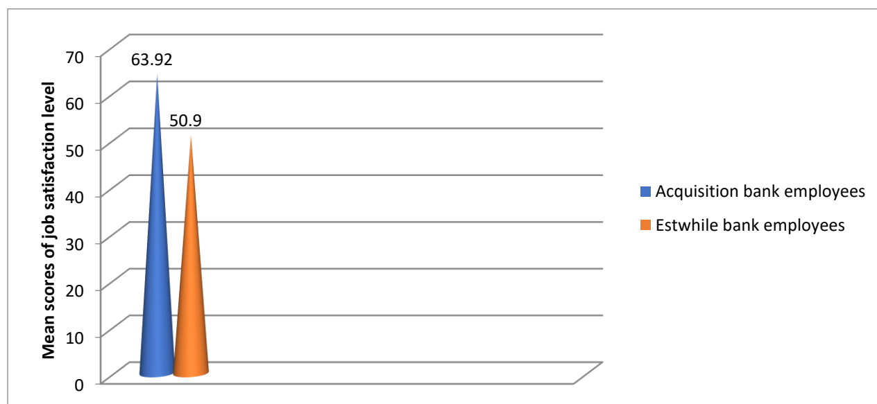
Table 1 shows that the t value of 3.53 (df = 98) is significant at the 0.001 level of significance. This means that acquisition bank employees and erstwhile bank employees differ significantly from each other in relation to their job satisfaction levels. The mean score of the acquisition bank employees group is 63.92 and SD is 23.49, whereas the mean score of erstwhile bank employees is 50.9 and SD is 8.55, which is lower than the acquisition bank employees and according to the manual of scale higher score indicates