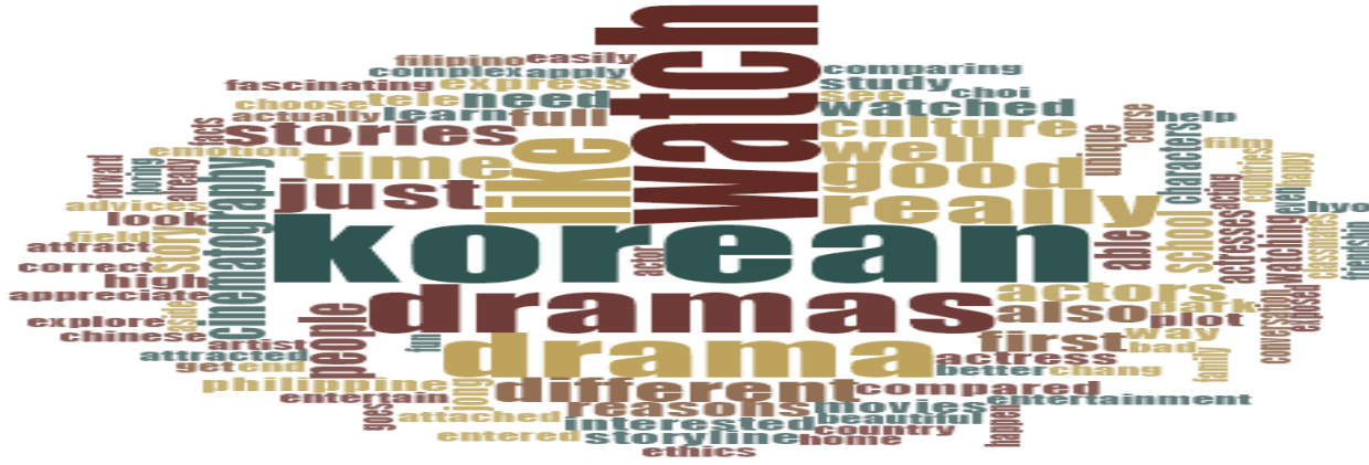
Fig. 3 Word cloud on the reasons for watching K-drama.

Definitely, K-Dramas are popular, trending, and fascinating among the student- respondents. These are popular television programs among millennials. In fact, they are really hooked and seem to be fanatics of this genre of Korean dramas due to a variety of reasons.