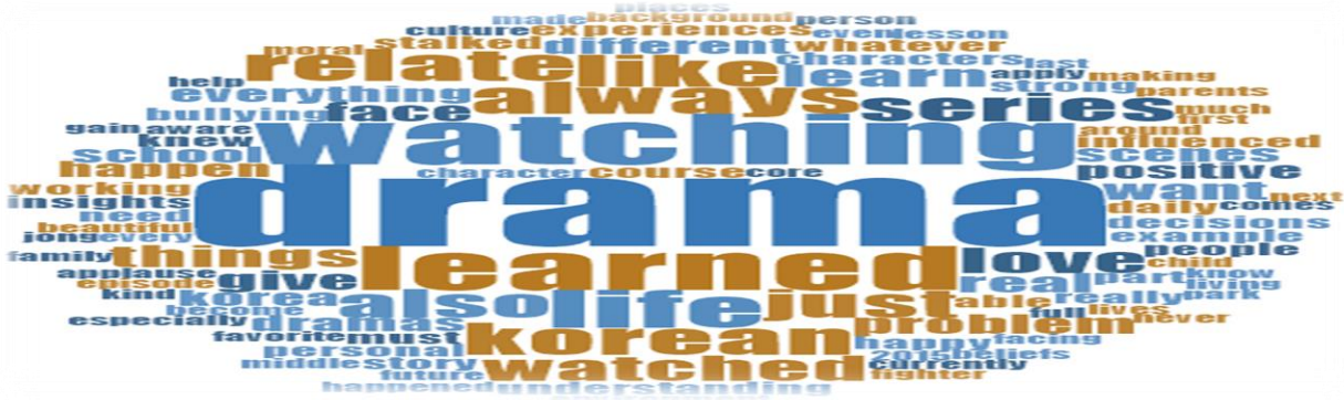
Fig. 6. Word cloud on the Lesson Learned.

K-dramas have brought a variety of lessons to the student-participants. They learn to be more positive and strong as they face challenges that they need to overcome. By watching K-drama, they have gained knowledge and understanding about the reality of life and where sound decision-making is of utmost importance.