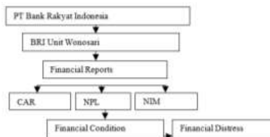
Figure 1. Conceptual Framework

Financial distress is a sign of bankruptcy. If bankruptcy is a failure of a company in carrying out its operational activities in order to generate company profitability for the sustainability of the company, financial distress is a situation in which a stage of decline occurs in the company's financial condition. This usually occurs before bankruptcy or liquidity. Simply put, financial distress is a signal and an early warning for a company to go bankrupt if it is not immediately addressed.