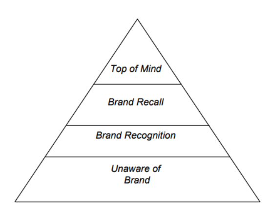
Figure 1 Pyramid of Brand Awareness

Aaker explained that customers have the ability to recognize and remember depending on the communication levels of a brand. Therefore, in research related to brand awareness, it is necessary to understand the levels as shown below.