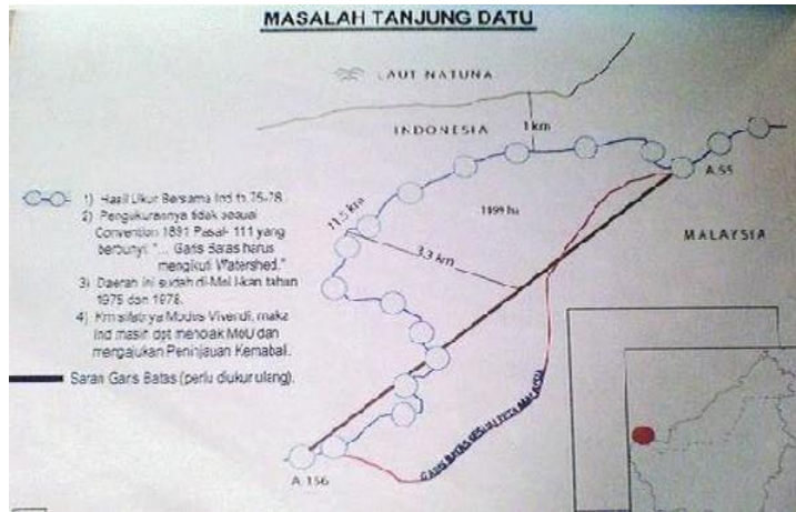
Picture 3 Placement of boundary stakes