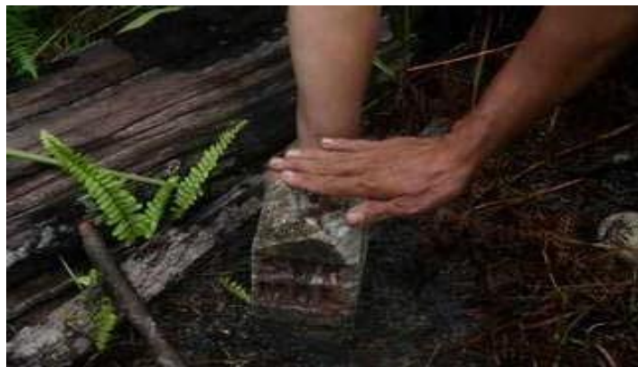
Picture 4. One boundary marker found in the Moon Camar

The government's homework that must be a priority is to enact a National Boundary Law and complete a map of the sea and land areas (by empowering the role of the Army Topography Directorate, the Naval Hydro-Oceanography Service, the Air Force Mapping Survey Center, the Ministry of Home Affairs, the Ministry of Foreign Affairs and other agencies). Also, the government must deposit the database of geographic coordinates of baseline and basepoints to UN international agencies by Article 16 paragraph (2) of UNCLOS III 1982 as soon as possible. Various problems arise after the local community discovers the destruction of boundary markers in the area allegedly carried out by the Malaysian.