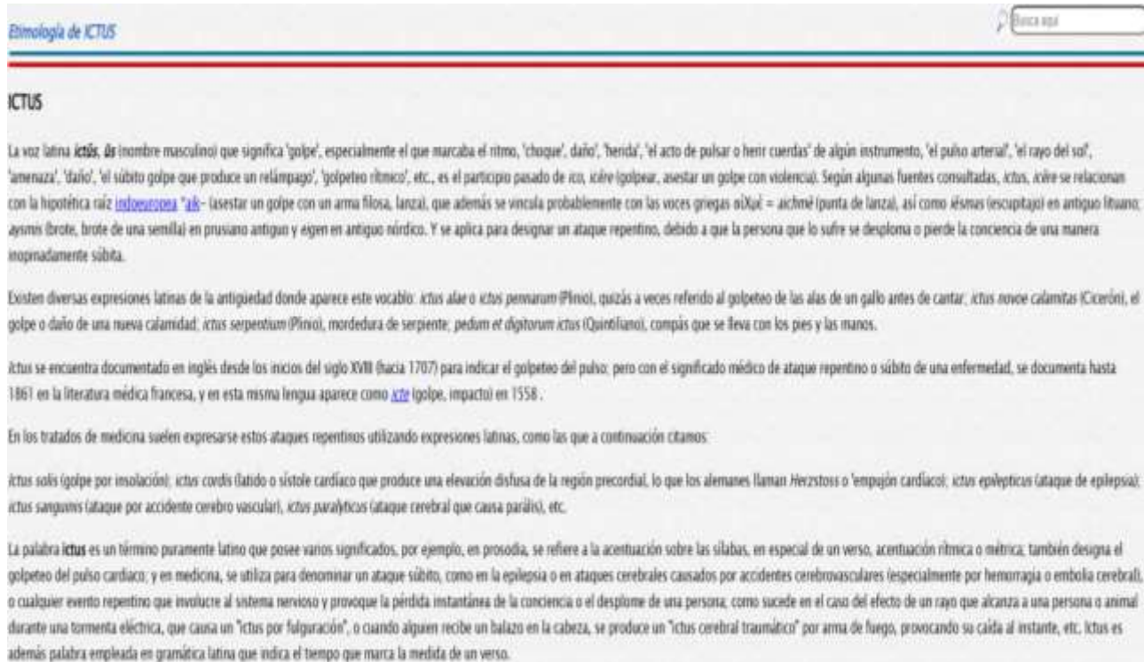
Figure 3: Etymology of the Word "Ictus"

In consequence, in Spanish language we are dealing with a term which dates back to the time of Ancient Rome [from ictus , ictūs ], meaning a blow, impact, shock, injury, and also meaning a word stress. Additionally, it is also related to Indo-European language ( aik- ), and Greek language ( αἰχμή • ( aikhmē )), all of them employed to depict a sudden attack.