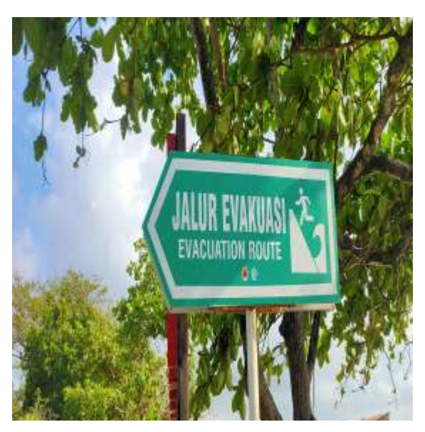
Figure 2. Tsunami Evacuation Route Sign

This sign exemplifies a top-down approach, as it is created by government authorities and aligns with national language policies. Scollon and Scollon (2003) note that top-down signs typically reflect official regulations and prioritize the national language, in this case, Indonesian, while also incorporating English to cater to international visitors. This aligns with Indonesia's language policy, which emphasizes the use of the national language while accommodating the needs of foreign tourists.