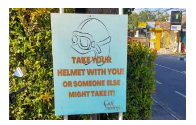
Figure 9. Private Business Alert Sign on Helmet Theft

The second sign as shown in Figure 9, posted by Café Smörgås, reads "TAKE YOUR HELMET WITH YOU! OR SOMEONE ELSE MIGHT TAKE IT!" This sign employs a more conversational and informal tone, using a direct address to the reader ("TAKE YOUR HELMET WITH YOU!") and a warning that leverages social accountability ("OR SOMEONE ELSE MIGHT TAKE IT!"). The sign uses a combination of capital letters and a clear, sans-serif font to ensure readability and impact. Unlike the police sign, this alert is written in English, targeting both local and international visitors, given the tourist nature of Sanur. The use of English reflects the café's awareness of its diverse clientele and its intention to communicate effectively with a broader audience.