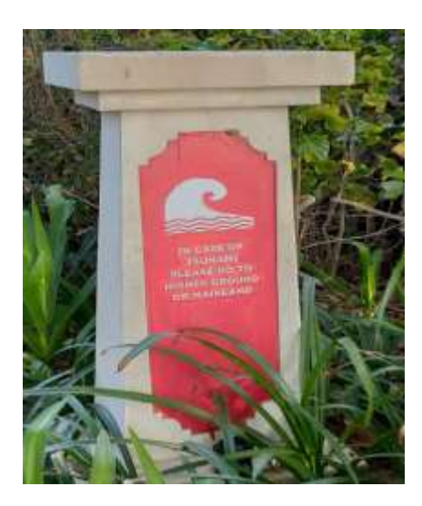
Figure 3. Tsunami Evacuation Route Sign at Hyatt Regency Hotel

The lexical choices in this sign are straightforward and imperative, providing clear instructions on what to do in case of a tsunami. The use of visual symbols, such as a wave and an arrow pointing towards higher ground, complements the textual message, ensuring that the information is conveyed quickly and effectively. Kress and van Leeuwen (1996) emphasize that clear and direct visual grammar is essential for communicating important messages, especially in emergencies. The placement of this sign in a high-traffic area near the beach underscores the hotel's commitment to guest safety and aligns with broader social and economic dynamics in Sanur. Ensuring tourist safety not only protects lives but also enhances the area's reputation as a safe and reliable tourist destination, which is crucial for sustaining the local tourism economy.