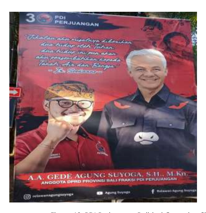
Figure 10. PDI Perjuangan Political Campaign Sign

The political discourse in Sanur's linguistic landscape is a reflection of the socio-political dynamics and the efforts of political entities to engage with the public. These signs are typically created by political parties and candidates to promote their agendas, highlight their achievements, and garner support. The analysis of a political campaign sign from the Indonesian ruling party, PDI Perjuangan (Indonesian Democratic Party of Struggle) provides insight into the strategies used in political communication.