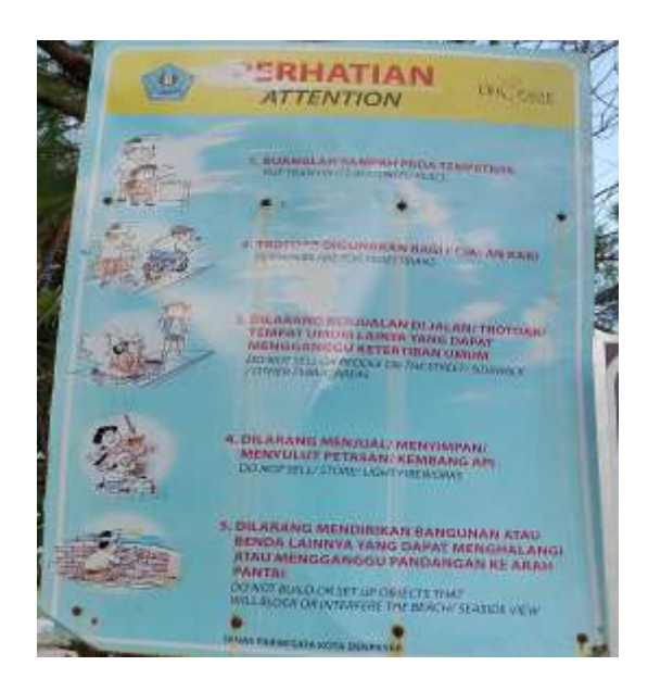
Figure 5. Regulatory Sign at Sanur Beach

The use of both Indonesian and English in these signs highlights the bilingual approach adopted to cater to both local residents and international tourists. This bilingual strategy ensures that the message reaches a wider audience, enhancing the sign's effectiveness. According to Landry and Bourhis (1997), the presence of multiple languages in public signs can enhance the sociolinguistic vitality of a community by promoting inclusivity and effective communication. The language used in these regulatory signs is straightforward and imperative, reflecting the authoritative nature of the message. For instance, commands such as "Do Not Sell/Store/Light Fireworks" and "Do Not Build or Set Up Objects That Will Block or Interfere the Beach/Seaside View" are designed to be direct and unambiguous. The choice of words emphasizes compliance and aims to prevent behaviors that could disrupt public order or degrade the environment.