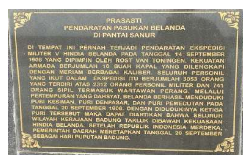
Figure 7. Commemorative Plaque at Sanur Beach

They serve to educate the public, instill a sense of pride, and preserve collective memory. The commemorative plaque detailing the landing of Dutch troops at Sanur Beach in 1906 is a prominent example of this type of discourse.