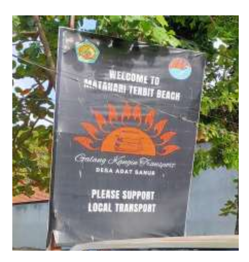
Figure 4. Protest Signs at Pantai Matahari Terbit

Shohamy and Waksman (2009) assert that public space is not neutral but rather a negotiated and contested arena; the linguistic landscape (LL) can be used as a tool for interpreting ongoing social, political, and economic issues within a community. This claim is highly relevant in the context of Sanur's linguistic landscape, particularly concerning the conflict between traditional and online transportation services. Signs such as "ONLINE TAXI DROPS ONLY!!!" and "PLEASE SUPPORT LOCAL TRANSPORT" installed by the local taxi association, Galang Kangin Transport illustrate how public space becomes an arena of contestation where various interests compete to regulate and influence its use.