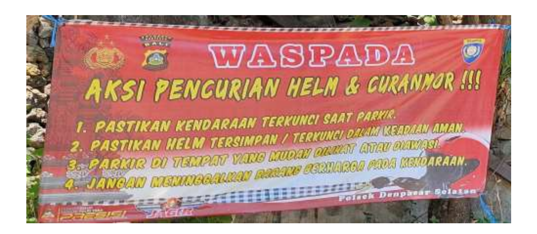
Figure 8. Police Alert Sign on Helmet and Vehicle Theft Prevention

The first sign, created by the Denpasar Selatan Police, prominently displays the word "WASPADA" (ALERT) in large, bold letters, followed by the message "AKSI PENCURIAN HELM & CURANMOR!!!" (HELMET AND MOTORCYCLE THEFT ACTIONS!!!). This sign uses a combination of bold, uppercase text and exclamation marks to emphasize the urgency and seriousness of the warning. The sign lists four specific instructions for preventing theft. These instructions are written in Indonesian, indicating that the primary audience is local residents. The use of simple, direct language ensures that the message is easily understood by a broad audience. The imperative form of the verbs "PASTIKAN" (ENSURE) and "JANGAN" (DO NOT) underscores the authoritative tone of the sign, reflecting its purpose as a regulatory and preventive measure.