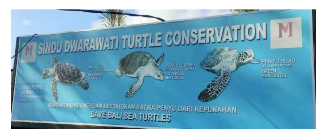
Figure 6. Educational Sign for Sindu Dwarawati Turtle Conservation

The "Sindu Dwarawati Turtle Conservation" sign is designed to inform the public about the different species of sea turtles found in Bali and the importance of their conservation. The sign lists three species: Hawksbill Sea Turtle ( Eretmochelys imbricata ), Olive Ridley Sea Turtle ( Lepidochelys olivacea ), and Green Sea Turtle ( Chelonia mydas ). It uses both Indonesian and English to cater to a broader audience, ensuring that the message reaches both local residents and international tourists. The use of bilingual text on this educational sign underscores the inclusive approach taken by the conservation program. According to Landry and Bourhis (1997), bilingual or multilingual signs can enhance the sociolinguistic vitality of a community by reflecting its linguistic diversity and promoting inclusivity. In this context, the bilingual approach helps bridge communication gaps and ensures that important environmental messages are accessible to all.