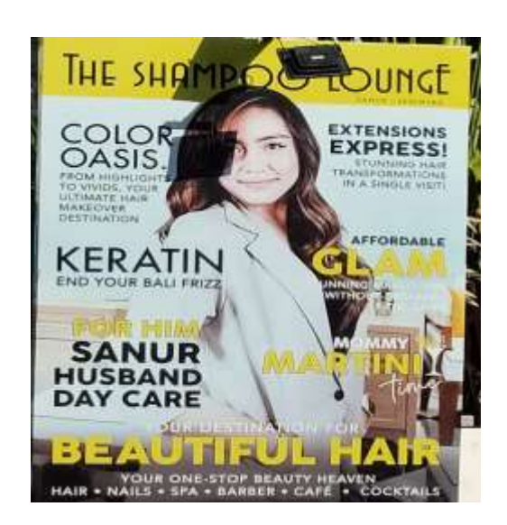
Figure 13. Promotional Sign for the Shampoo Lounge

The commercial discourse in Sanur's linguistic landscape reveals the strategies used by businesses to attract customers and promote their services. These signs are designed to capture attention, convey the benefits of products or services, and persuade potential customers to make a purchase. An analysis of the promotional sign for "The Shampoo Lounge" provides insight into the techniques employed in commercial signage.