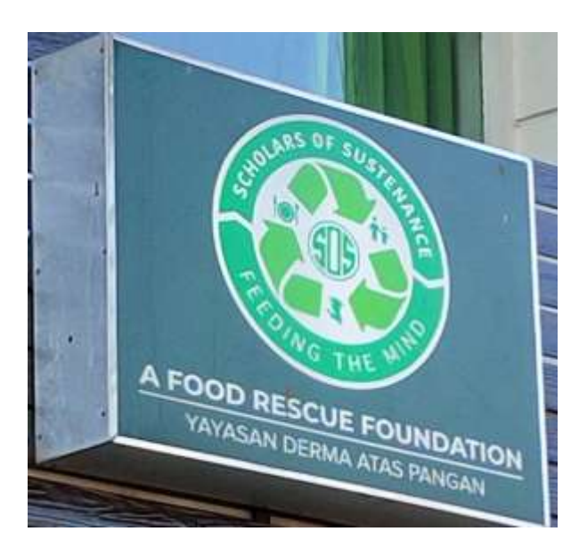
Figure 12. Identity Sign for Scholars of Sustenance Foundation

The "Scholars of Sustenance Foundation" sign in Figure 11. prominently features the organization's name and logo, along with the tagline "Feeding the Mind" and the description "A Food Rescue Foundation" in English and "Yayasan Derma Atas Pangan" in Indonesian. This bilingual approach ensures that the message is accessible to both local and international audiences, reflecting the organization's inclusive mission.