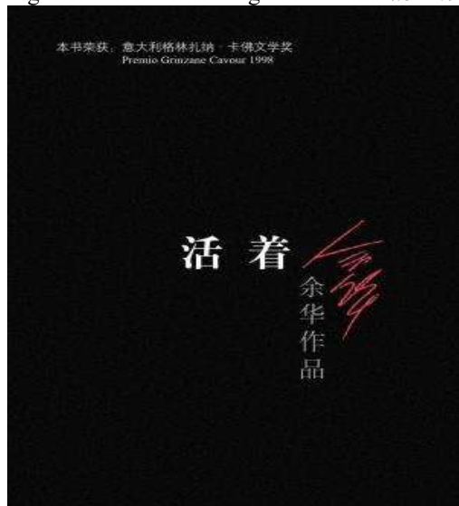
Figure 1 Cover of the original novel "Huo Zhe" (Left) and the translated novel "Hidup" (Right)