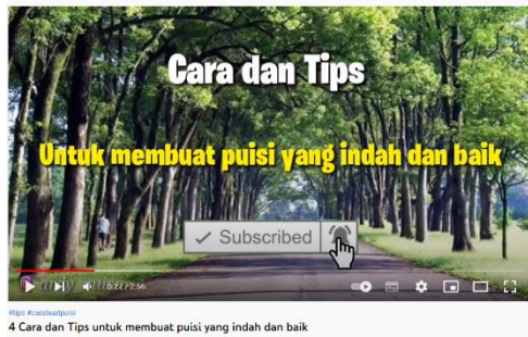
Image 1.1 Tips for making poetry

Not only students but teachers will also find it easier with this YouTube application. Teachers can get easy material to show to students; this media is very beneficial for teachers because it is easy to access for teachers and students. For example, in Indonesian language practice materials that require examples of natural body movements and gestures, such as how to present the news, give a speech, or even how to recite poetry, the teacher can directly show videos from YouTube to show students in that way the teacher can also show which what is wrong and right in teaching practice. Not only providing material in the form of videos from YouTube, but teachers can also create content containing Indonesian language teaching materials, namely those related to literary matters or text writing. Examples of YouTube content containing Indonesian language learning materials are as follows.