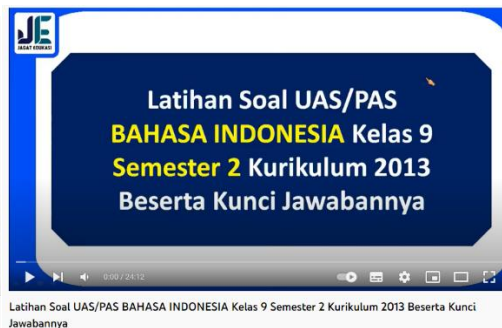
Image 1.4 UAS/PAS practice