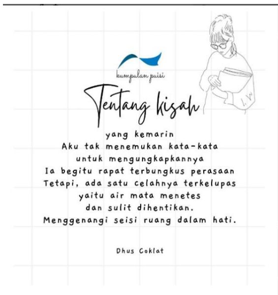
Image 1.7 Examples of Poetry on Instagram