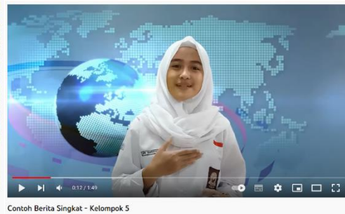
Image 1.2 Examples of Short News