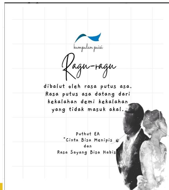
Image 1.6 Examples of Poetry on Instagram