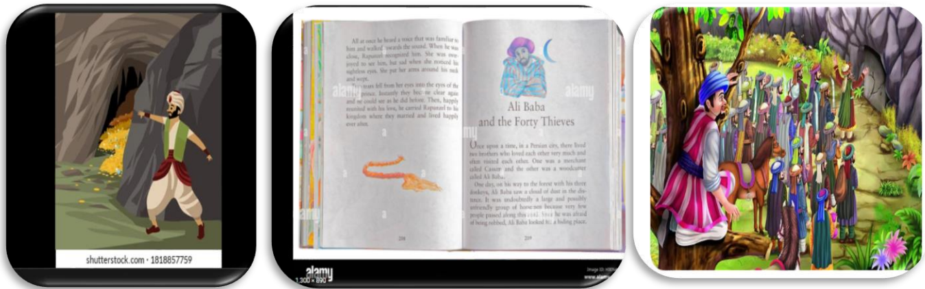
Figure No. (1) The Pantomime Images of the Tale with Artworks Illustrations.

Iraqi folklore includes some common superstitions. For example, it is considered good luck to have a stork build its nest on your roof. Women who have had no children and people with blue eyes are not allowed to attend birth celebrations to keep harm from coming to the baby.