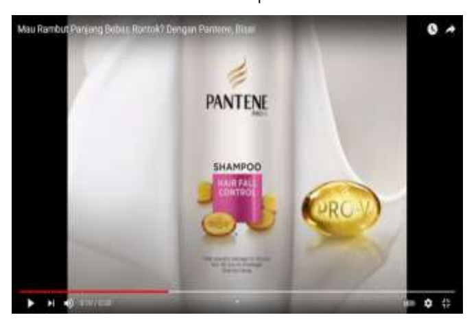
c. visual emblem