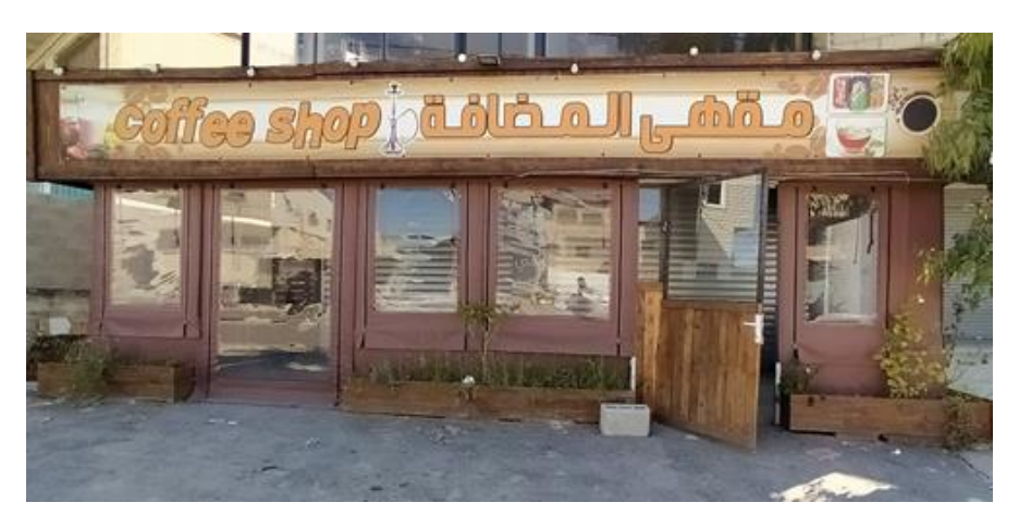
Figure 7. Arabic-English bilingual sign - Coffee shop

As can be seen in Tables 5 and 6, language choice differs significantly depending on the area. In Huwwara center, monolingual Arabic signs are the most common type of signs. The majority of businesses, including automotive services/spare parts shops (69.23%), convenience stores (90.91%), restaurants (86.67%), and house/sanitary ware stores (73.33%), place Arabic on their signs. Hebrew can be found on signs of mainly two types of businesses, namely, automotive services/spare parts shops (23.08%) and household goods stores (20%). Still, Hebrew in Huwwara center is not very salient compared to Arabic. The use of English on signs is limited and can be found mainly on signs of coffee/pastry shops (60%).