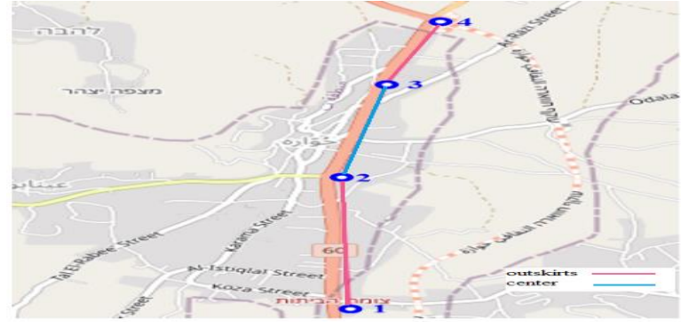
Figure 3. Context in which research was carried out

This study draws upon Spolsky and Cooper's (1991) model of language choice on signs. Moreover, it takes on Gorter and Cenoz's (2006) view on the unit of analysis of signs in that the establishment as a whole is considered as a unit of analysis rather than individual signs. As a result, businesses on the main street with more than one sign are considered as a single unit of analysis; if a given business has two signs, one written in Arabic and the other in Hebrew, it is considered to have one Arabic-Hebrew bilingual sign. Furthermore, only primary texts, which are texts that consist of the shop name and type (Nikolaou 2016), were analysed whereas, signs in the interior were disregarded. Units of analysis were classified according to 1) the occurrence of languages on signs in each area, 2) type and number of businesses in each area, and 3) the languages displayed on the signs of each business. Signs of businesses were classified according to the goods and services they offer.