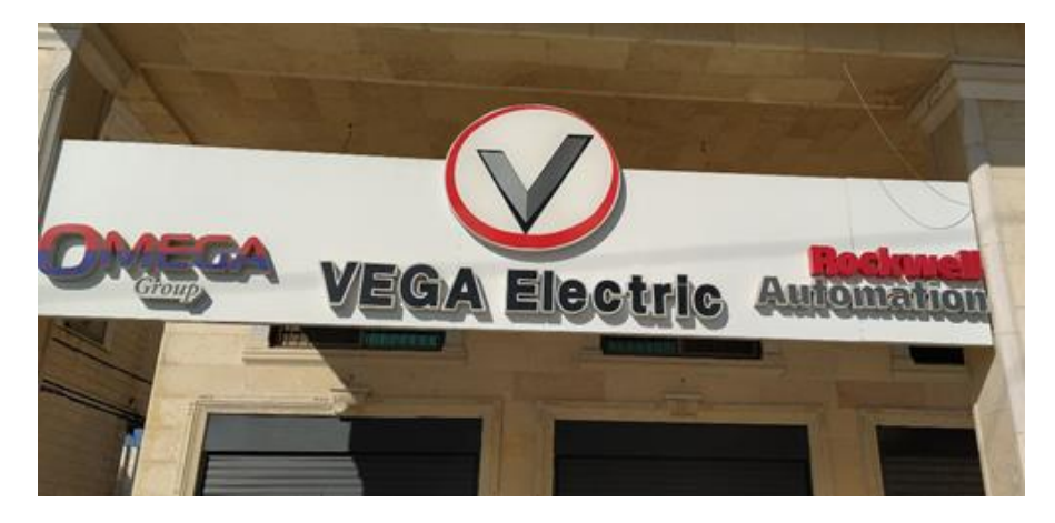
Figure 5. English monolingual sign - Electrical shop.