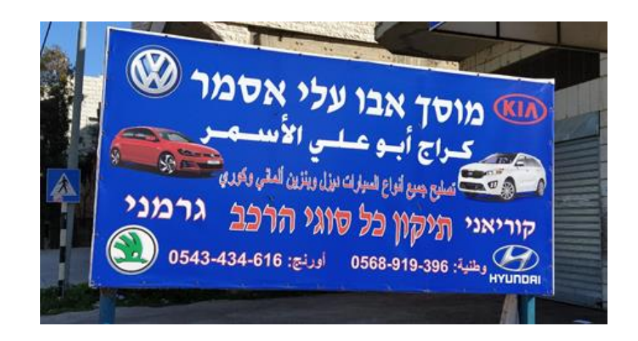
Figure 6. Arabic-Hebrew bilingual sign - Car mechanic