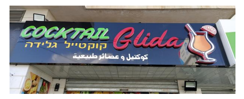
Figure 8. Arabic-English-Hebrew trilingual sign - Snack bar