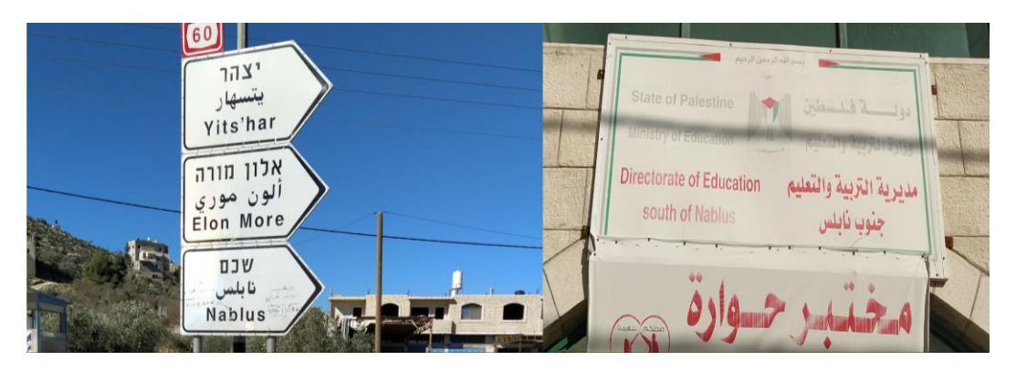
Figure 2. Top-down sign put in place by the Israeli government (left) versus top-down sign put in place by the Palestinian government (right) in Huwwara.

In Huwwara, top-down signs can be classified into two types: signs put in place by the Israeli government, such as road signs, and signs put in place by the Palestinian Authority, such as signs outside official Palestinian offices and other official buildings in the town. Road signs tend to be trilingual as they are put in place by the Israeli government since most of Huwwara is labelled as Area C. Placing Hebrew above other languages, namely, Arabic and English, on road signs in Palestinian towns located in Area C is symbolic of the Israeli dominance over these areas. As Gorter (2013) suggests, placing Hebrew on top in signs in the old city of Jerusalem after it came under Israeli control in 1967 "demonstrates the Israeli rule and dominance of Hebrew" (p.5). Top-down signs in Huwwara put in place by the Palestinian Authority tend to include text which is either monolingual Arabic or bilingual Arabic-English.