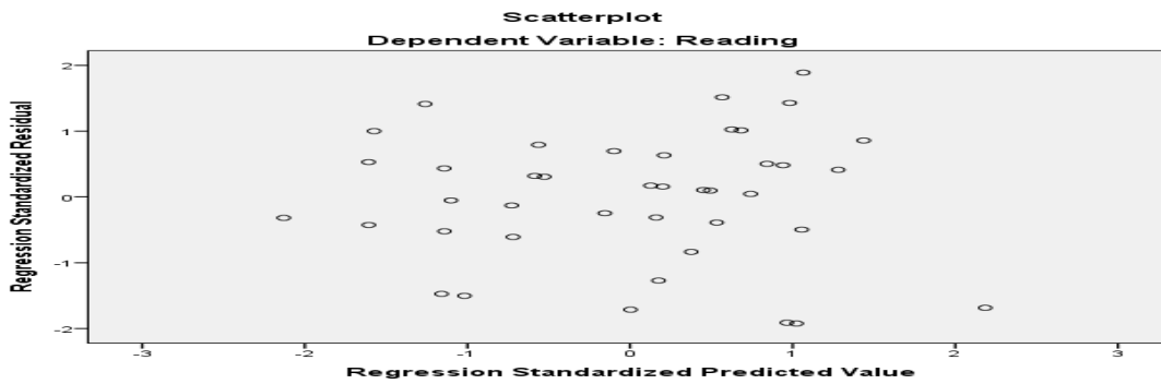
Figure 2: Scatterplot of Regression Standardized Predicted Values against Regression Standardized Residuals (Reading Strategies Types).