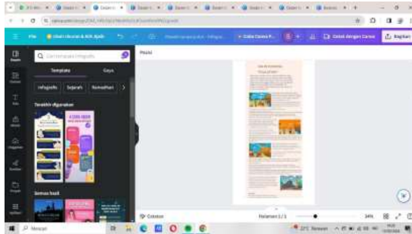
Figure 1. "Infographic, Folklore narrative text"

By using infographic templates, educators (teachers) can produce imaginative and captivating narrative text infographics in English. Open the Canva application or desktop version of the website at https://www.canva.com to get started. Canva application or desktop version of the website at https://www.canva.com to get started. Go to Google or Facebook to log in or register, then start designing by searching for narrative content.