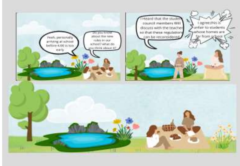
Figure 3. Designing comics Asking and Giving Opinion

The "Asking and Giving Opinion" teaching resources. Educators can utilize comic templates to build imaginative and captivating English dialogues. Making a comic on the internet is easy to begin with. To begin, launch the Canva app or navigate to https://www.canva.com on your PC. Use Google or Facebook to log in or register, then look for a "comic template" to start designing.