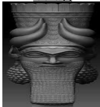
Part No. (2)

As observed in the preceding part, the upright head denotes a sign of looking towards an open horizon. The height of the wing suggests an absolute space, so the extension of the wing to the top indicates that the winged bull has left the horizon of his physical world and entered the space of his spiritual world as if the head and the wing are a visual metaphor for the horizon and the lobe.