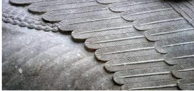
Part No. (1)

As far as the above part is concerned, it involves certain signs. The wing here is a symbol of the liberation of the imagination from the bondage of the temple after its owner submitted to divine servitude. That is, it is a symbol of the realization of the dream of ascending to the upper world, being saved from slavery and its imperfection, and joining the gods and their perfection.