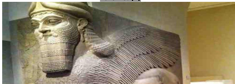
Part No. (4)

With reference to the previous part, the wide open eye is a symbol of alertness and anticipation, denoting that it communicates with us in a manner similar to an elegy discourse of history that will not be forgotten and will not return. Such a view also points out that there are some future things that will happen.