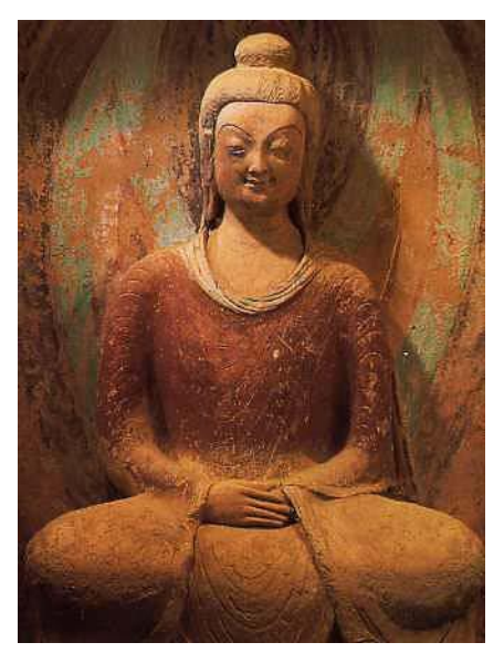
Figure 1. Meditation Buddha Statue, Cave 259, Northern Wei

The intangible cultural heritage of colored sculptures is significant since they combine the wisdom of old times with the skills of ancient cultures. It had historical significance. Cultural heritage has an emotional attachment. Making a colored sculpture depends on the conditions of the environment. Creating a colored clay sculpture begins with finding a wood stick that has a similar shape and using it as the foundation of the sculpture. Then, combine the mud and dry grass to build the body. After this, mix the mud and soft sand to add layers and create the different parts of the sculpture.