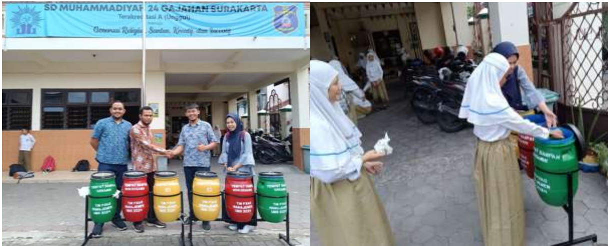
Image 6. Handover bins and practicing how to use it correctly