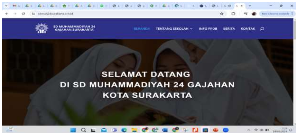
Image 5. School Website of SD Muhammadiyah 24 Surakarta, Indonesia.

Assistance in creating a website is one of the programs assisted by the service team in order to facilitate accessibility for the community to the latest information regarding SD Muhammadiyah 24 Surakarta. Apart from that, this website can also be a promotional tool.