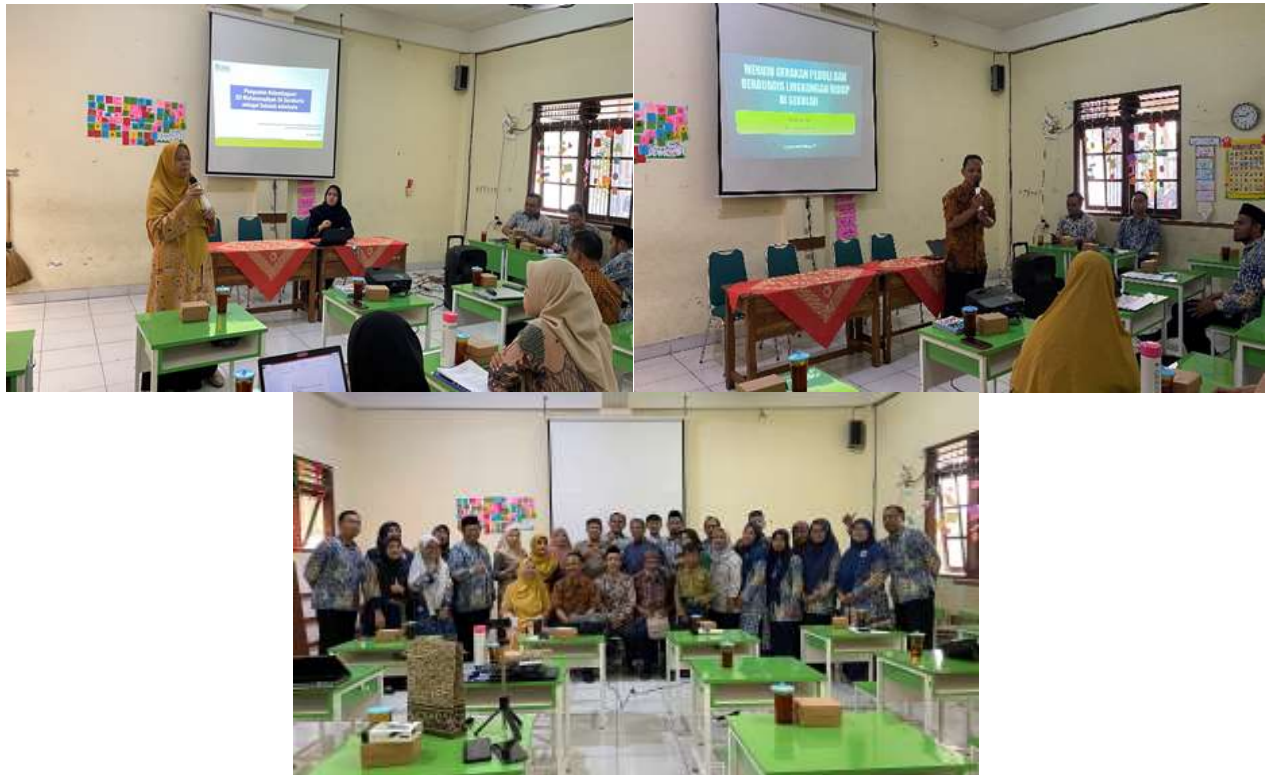
Image 3. Green school workshop and socialization